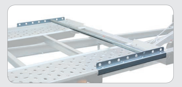
Set hole profile and locking bar (locking bar set)