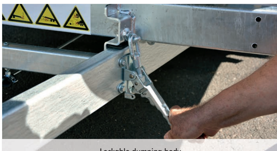
Lockable dumping body