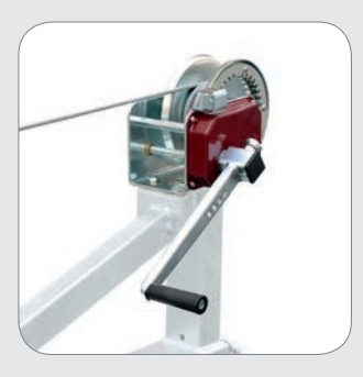
rope winch incl. rope