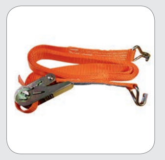
tension belt set