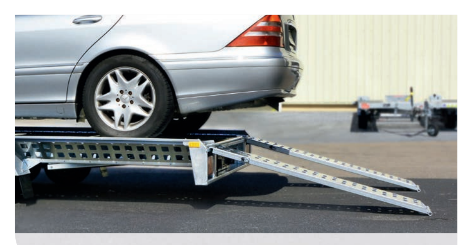
Loading ramps retain contact with the ground during tipping.

Pictures are classic examples and partly contain accessories.