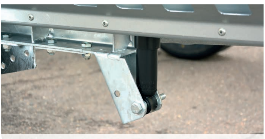
Dumping body can be tilted with dampers (maintenance free, hydraulic)

Pictures are sample illustrations and may include special equipment.