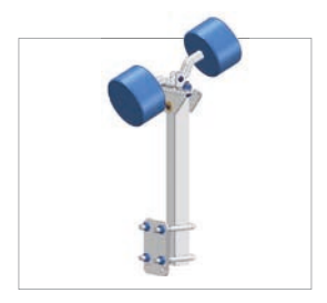
slip roller with holder