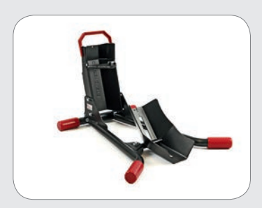
cradle-style wheel holder