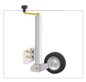
automatic jockey wheel