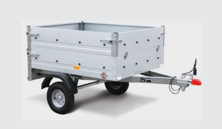
You obtain more loading volume through the practical raised side panels which are optionally available as accessories.