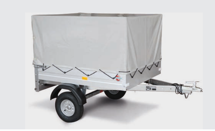
High covers with frame protect your load and facilitate its convenient transportation.

Pictures are classic examples and partly contain accessories.