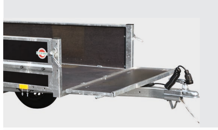
front panel is foldable, for effortless unloading