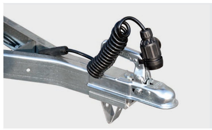
spiral cable with 13-pin connector for flexible connection to the towing vehicle (EC-equipment)

Pictures are classic examples and partly contain accessories.