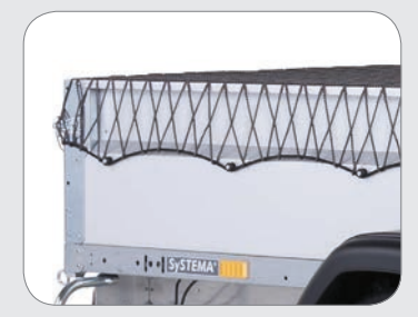
load securing net