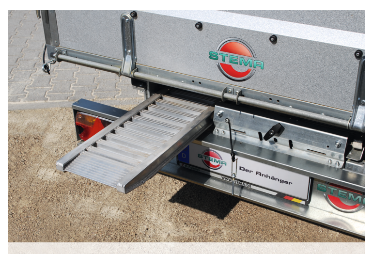
loading ramp is intelligently stowed away

A lockable compartment for ramps is provided between the chassis and tipper body. This can be retrofitted without any great effort. The compartment ensures safe and smooth transportation throughout the whole trip. The matching aluminum loading ramps can be adjusted throughout the entire loading width and available as an accessory.