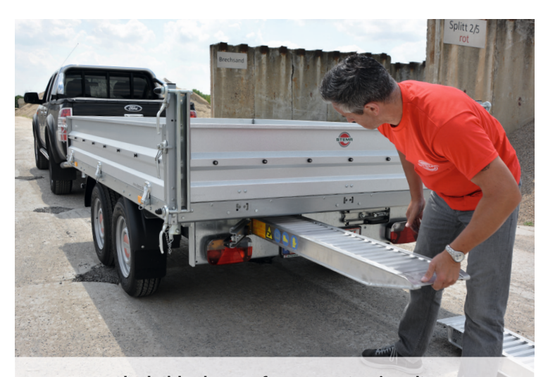
lockable drawer for ramps (optional)

The aluminium ramps can be slided over the entire loading width. They fit in every track gauge. A rail bracket can be optionally integrated in the chassis and contains a lockable compartment. A safe and smooth transport can be always guaranteed.