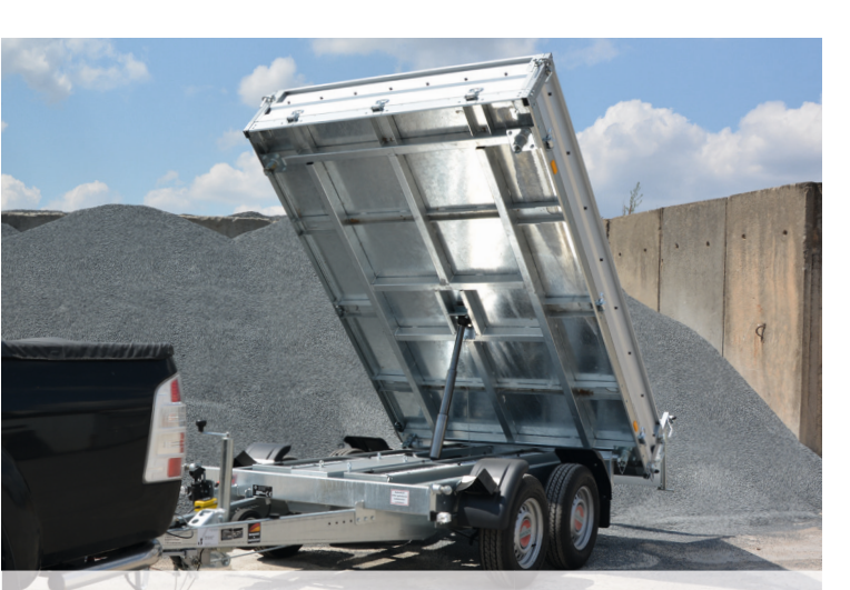
hard chrome plated 3-stage telescopic cylinder

For the transport of bulk material, construction materials, and construction machinery or work tools: The new STEMA three-side tipper: Best fit for industrial use. It is tipped by use of a user-friendly manual pump or with the hydraulic electric pump which is included as a standard and can be used with 3.500 kg permissible weight.